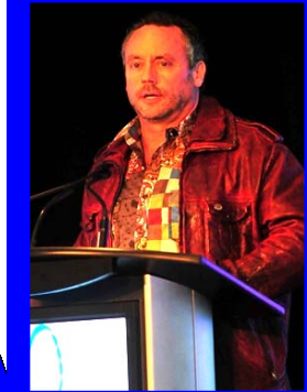
Keynote Speaker W. Brett Wilson, star of CBC's Dragon's Den.