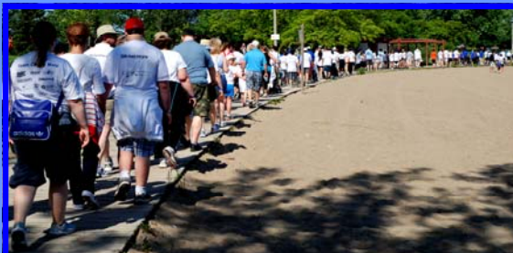
Hundreds of walkers on the boardwalk.