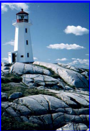
Peggy's Cove, Nova Scotia