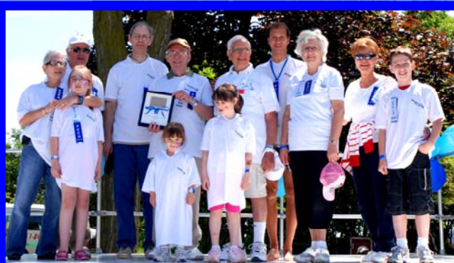
The 2011 "TOP SURVIVOR" Fundraising team - PCCN-Toronto.

This was a fabulous event at a terrific location and we are already looking forward to Father's Day 2012 . We hope that you will consider joining us at that time, not only to help us raise more funds for prostate cancer, but also to walk with us on the boardwalk as we all celebrate part of Father's Day together! We'll see you all then.