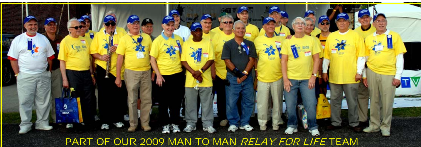
PART OF OUR 2009 MAN TO MAN RELAY FOR LIFE TEAM

"Thank you" to everyone who participated in Relay for Life 2009!