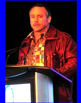
Keynote Speaker W. Brett Wilson, star of CBC's Dragon's Den.